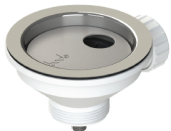
1 x AX1002 (m) 90mm (1.5") Orbit manual basket strainer waste - long bolt