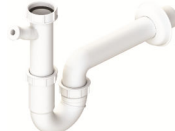
1 x AX1008 (m) 1.0 Bowl pipework