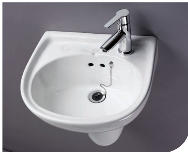
505mm wide Wash Basin with Semi Pedestal and Monobloc Mixer Tap