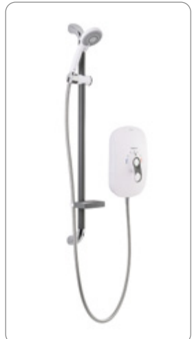
Optional riser rail: Dark Blue