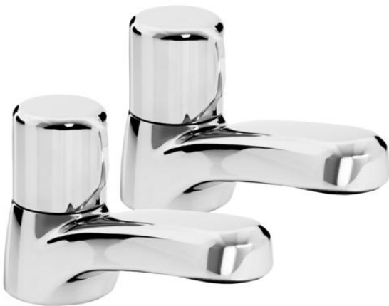
*shown with CHC SNUB C handles