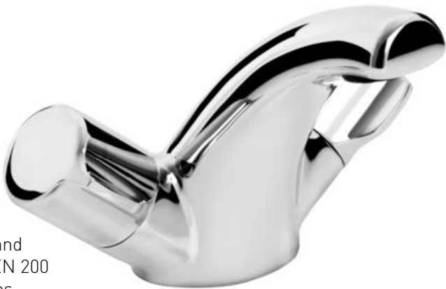
*shown with CHC SNUB C handles

Product Code: CHC BAS C Finish: Chrome Product Type: Contemporary Construction: Body is of brass construction and is designed to conform to BS EN 200 Cartridge Type: 1/4 turn 1/2" Ceramic Disc Valves Supply: Suitable for all plumbing systems Inlet Connections: M10 x 15mm Copper Connecting Pipes Working Pressures: Min 0.3bar, Max 5.0bar