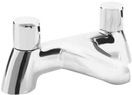
*shown with CHC SNUB C handles