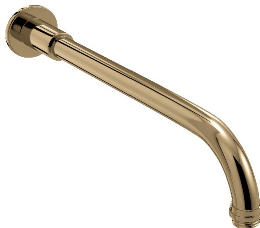
Vintage Gold shown