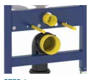
STEP 4: PROTECTION

Connect the isolation valve to the water supply and connect the drainage.