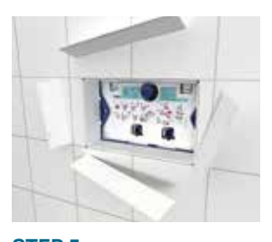
STEP 5: PLASTER AND TILE YOUR INSTALLATION

Once the frame is in position and the supply and drainage are connected, ensure that you protect the flush pipe, drainage connection and metal rods with the covers provided. This will stop debris building up during the plastering and tiling phase.