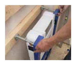
STEP 1: MOUNT DUOFIX WC FRAME TO THE WALL

There are four fixing points two to the wall and two into the floor.