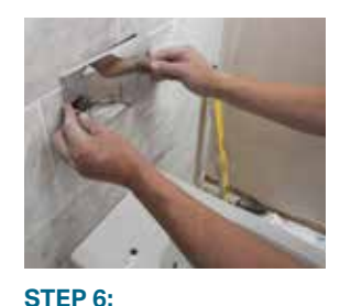
FIX WC AND FLUSH PLATE

You are now ready to plaster and tile your installation. When you've completed that, you can cut down the protection housing flush with your tiles and remove the protection covers ready to fix the WC.