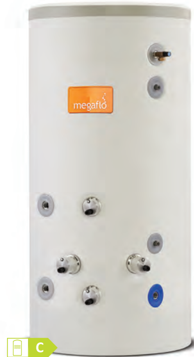
ECO PLUS FLEXISTOR 500 LITRE