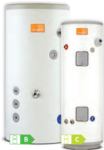
400 LITRE INDIRECT

Builds on Megaflō Eco by offering significantly larger capacity options, faster heat recovery times, doubling the flow rate. Direct (250/300 litre) and indirect solutions are available.