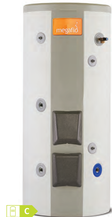
COMMERCIAL FLEXISTOR 500 LITRE