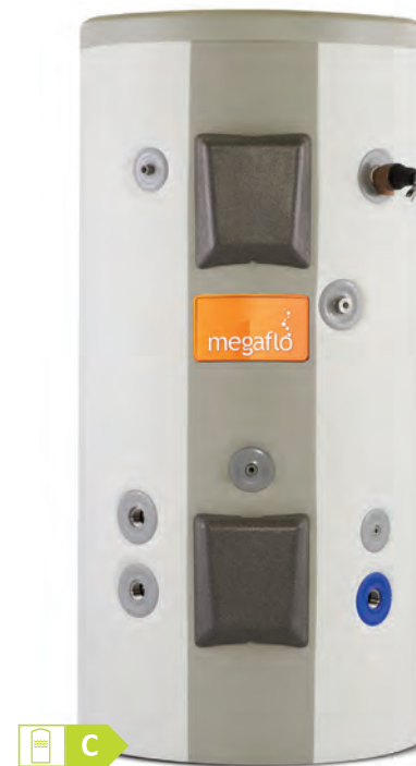
COMMERCIAL 500 LITRE INDIRECT

Designed for the most demanding applications such as hotels, leisure centres, office blocks and shopping malls, where there's often a need for lots of hot water very quickly, without loss in performance. The Megaflō Commercial calorifiers offer large scale, commercial capacity, heat recovery times and flow rates. Indirect cylinders and twin coil solar options are available.