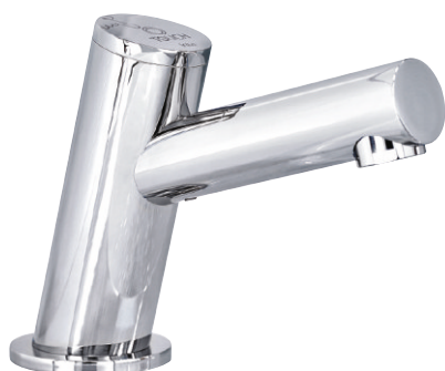
Perfect Time - Deck Mounted

With an 8 second factory preset, installation or maintenance staff can easily change this time manually according to the needs. Running time adjustment is not accessible to the end users.