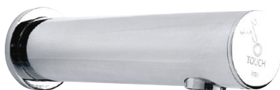
Perfect Time - Wall Mounted