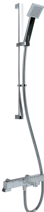
mio thermostatic bath shower mixer with flexible slide rail kit and deck mounting legs MI30024CP