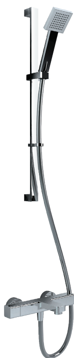
mio thermostatic bath shower mixer with flexible slide rail kit MI30014CP