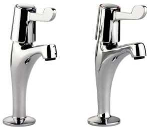
AquaPillar Tap (pair) with lever handles.