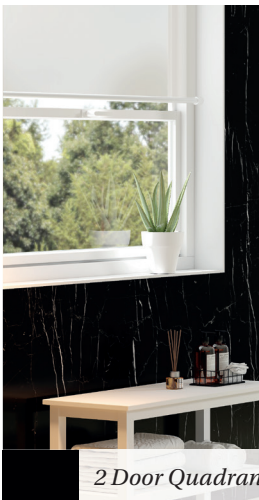
2 Door Quadrant