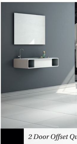
2 Door Offset Quadrant