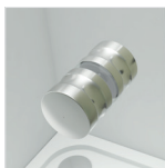
IONIC Source Handle