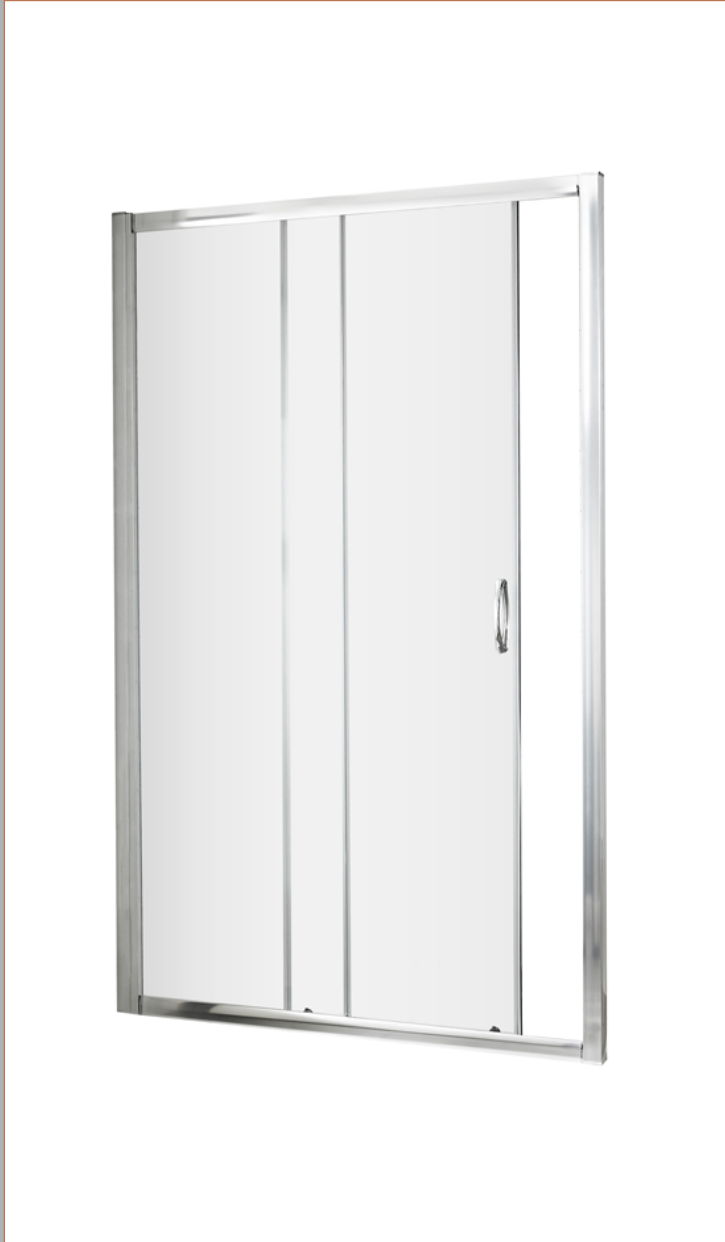
Ella Slider Enclosure

Description: Ella 1200mm Sliding Door (1850mm)