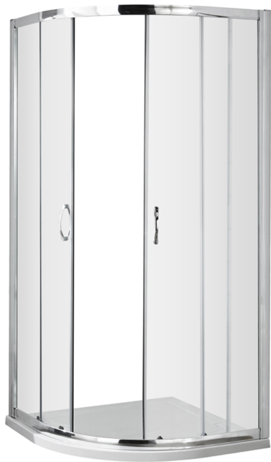
Ella Quadrant Enclosure

Description: Ella Quadrant Enclosure 800X800mm