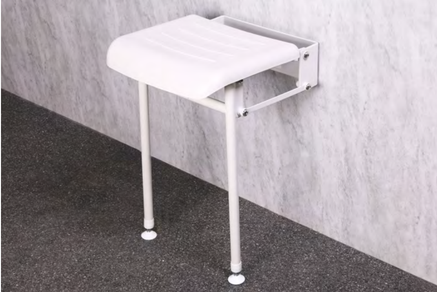
Premium wall mounted shower seat with legs