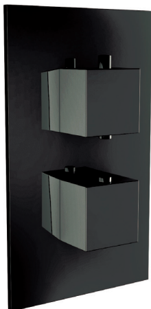
Dimensions (measurements in mm)