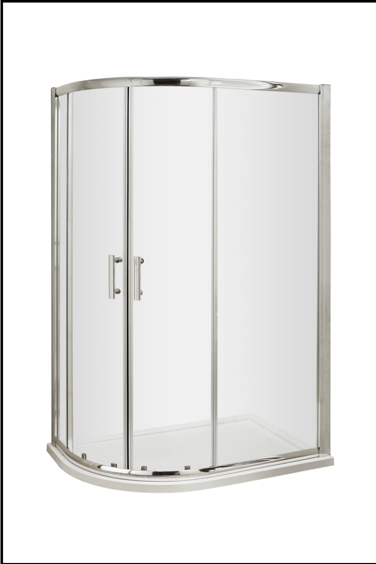
Pacific Offset Quadrant Enclosure

DESCRIPTION: Pacific Off/Set Quad Enclosure 900X760