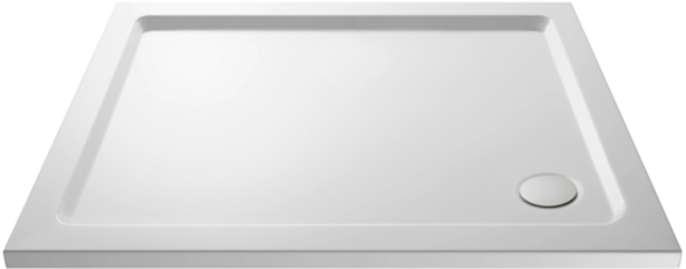
NTP022 - 1200 x 760 RECTANGULAR TRAY

DESCRIPTION: Rectanglar Tray 1200X760x40