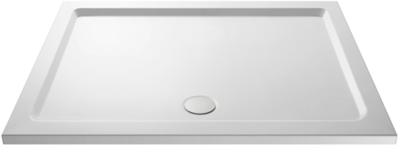
NTP063 - 1700 x 800 RECTANGULAR TRAY

DESCRIPTION: Rectanglar Tray 1700X800x40