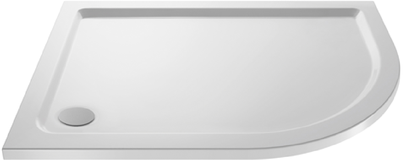
NTP113 - 1200 x 800 OFFSET QUADRANT TRAY RH

DESCRIPTION: Offset Quad Tray Rh 1200X800x40