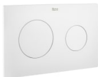
PL10 DUAL - Dual flush operating plate for concealed cistern with matt finishes