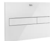
PL7 DUAL - Dual flush operating plate for concealed cistern