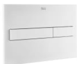
PL7 DUAL - Dual flush operating plate for concealed cistern