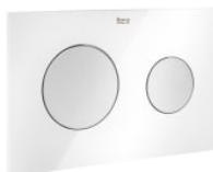
PL10 DUAL - Dual flush operating plate for concealed cistern