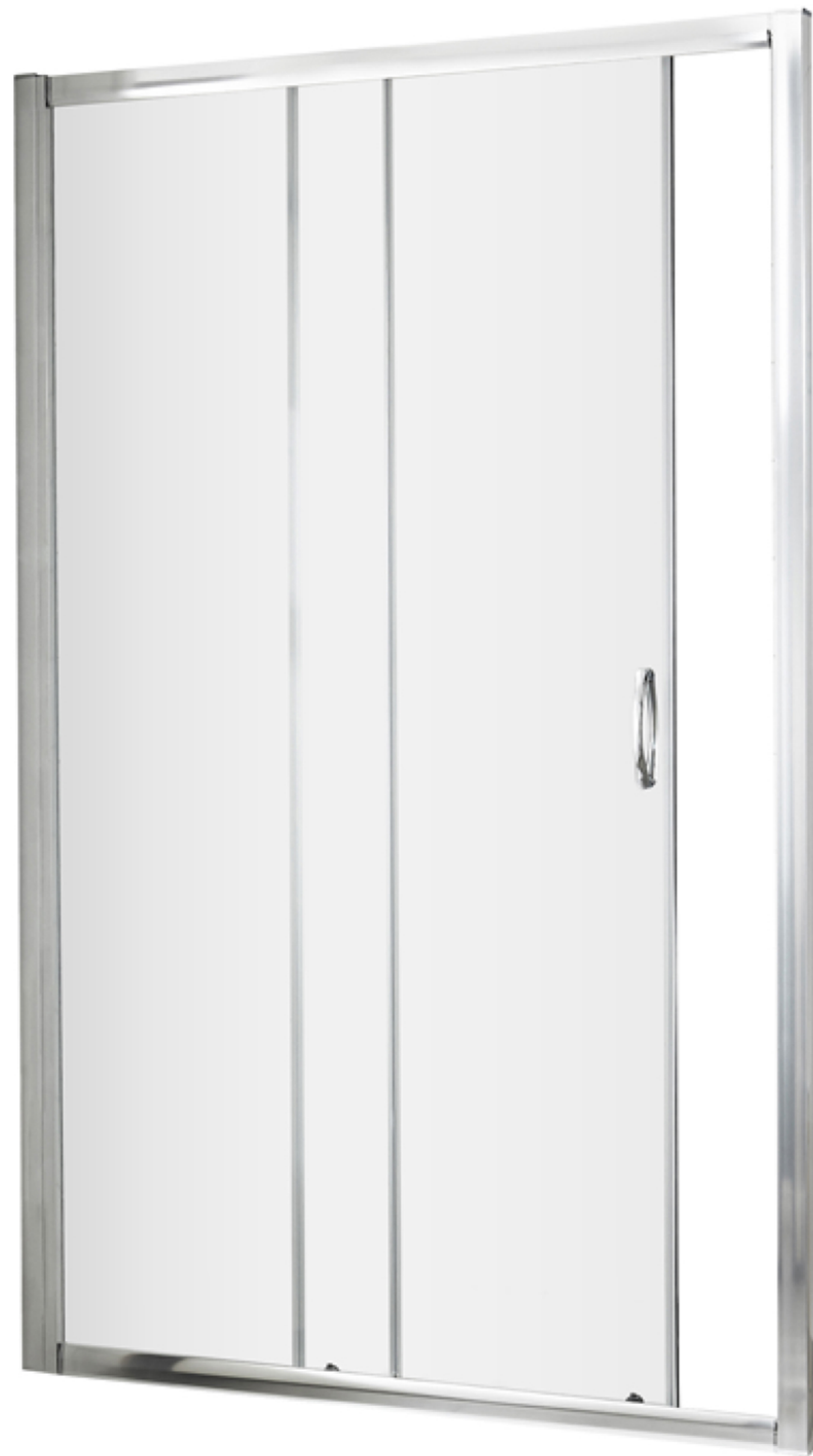
Ella Slider Enclosure