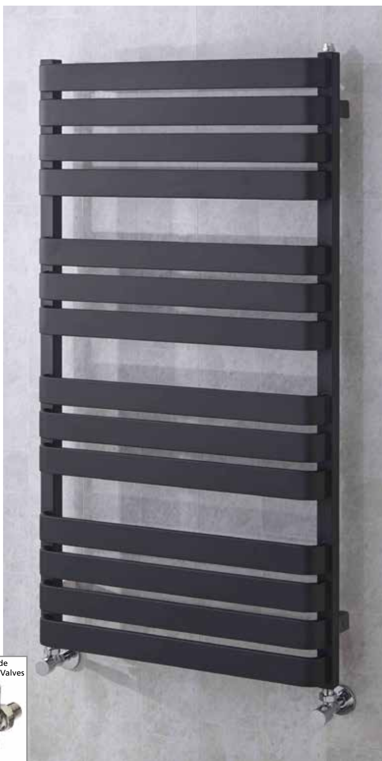
◆ 1110mm x 600mm in RAL 9005 shown with DRAKE Valves.