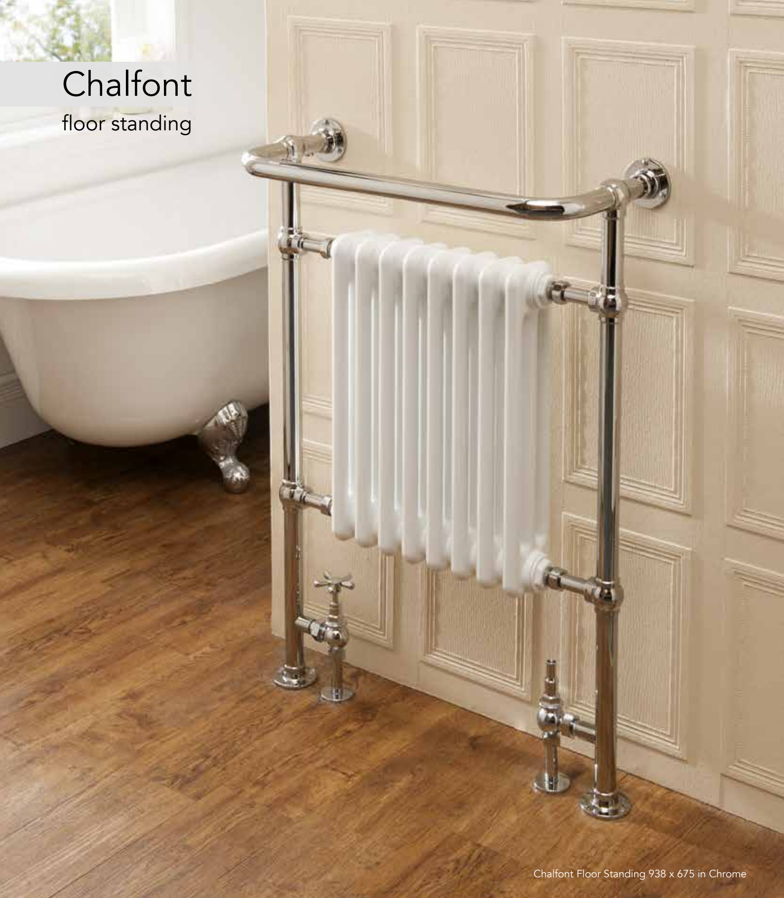
Chalfont Floor Standing 938 x 675 in Chrome