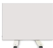
Optional wheels for freestanding panels