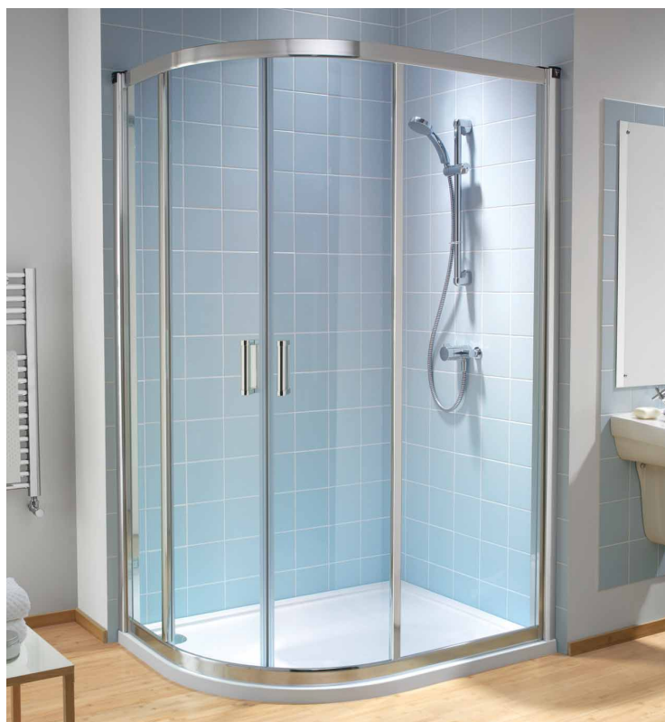
Outfit offset quadrant

consists of two fixed and two curved sliding panels 6mm glass can be fitted from the outside