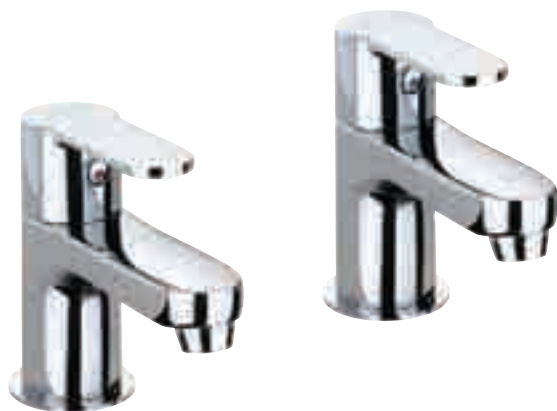
X50 Basin 1/2" Pillar Taps

suitable for both high & low pressure applications flow regulator can be added to control water usage & comply with BREEAM