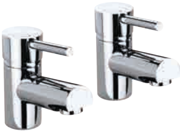
X60 Basin 1/2" Pillar Taps

1/4 turn ceramic cartridge suitable for both high & low pressure applications flow regulator can be added to control water usage & comply with BREEAM