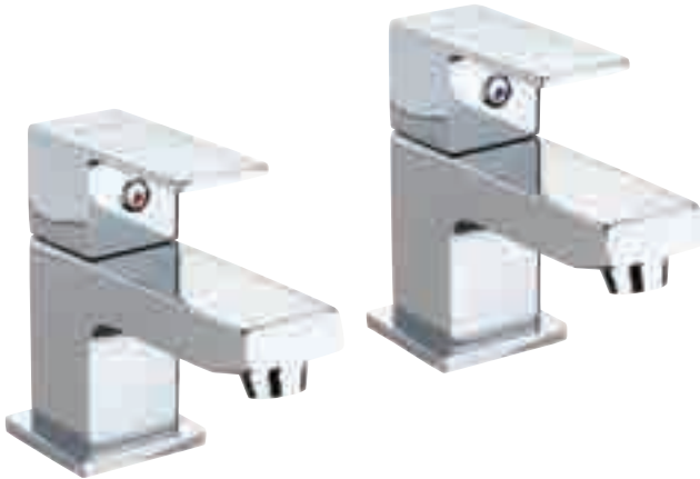
X62 Basin 1/2" Pillar Taps

1/4 turn ceramic cartridge suitable for both high & low pressure applications flow regulator can be added to control water usage & comply with BREEAM