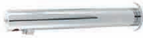
Sola wall mounted infra red spout, round

sensor underside of tap for hygienic non-touch operation automatically stops after 70 seconds maximum battery or mains powered