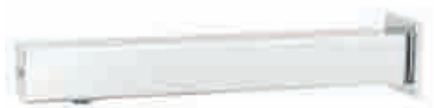
Sola wall mounted infra red spout, square

sensor underside of tap for hygienic non-touch operation automatically stops after 70 seconds maximum battery or mains powered