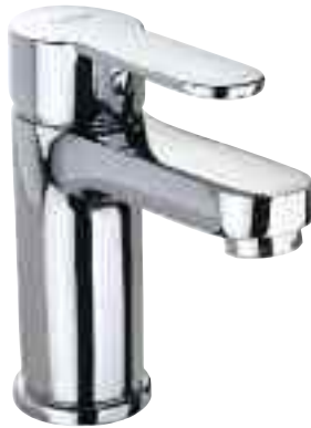
X50 Basin Mono Mixer - Mini Inc Click Clack Waste

complete with ceramic cartridge & flexible tails suitable for both high & low pressure applications flow regulator can be added to control water usage & comply with BREEAM