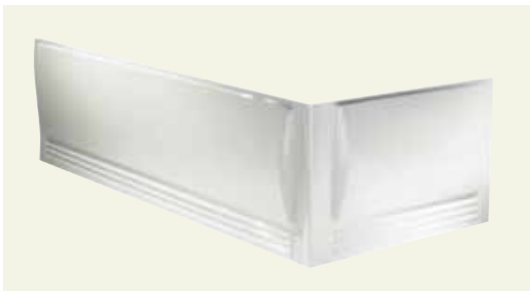
Omnifit bath panels

Secured under bath rim using clips supplied with bath and screwed to timber blocks (not provided).