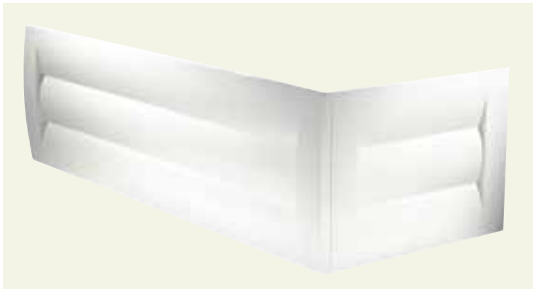
Neptune bath panel