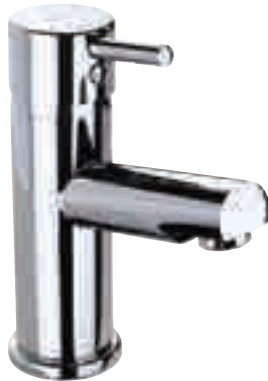
X60 Basin Mono Mixer - Mini Inc Click Clack Waste

complete with ceramic cartridge & flexible tails suitable for both high & low pressure applications flow regulator can be added to control water usage & comply with BREEAM