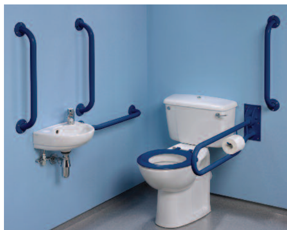
Doc.M value pack with blue grab rails & seat