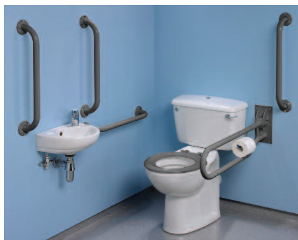
Doc.M value pack with grey grab rails & seat