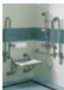
Doc.M shower packs white, blue or grey rails & seat