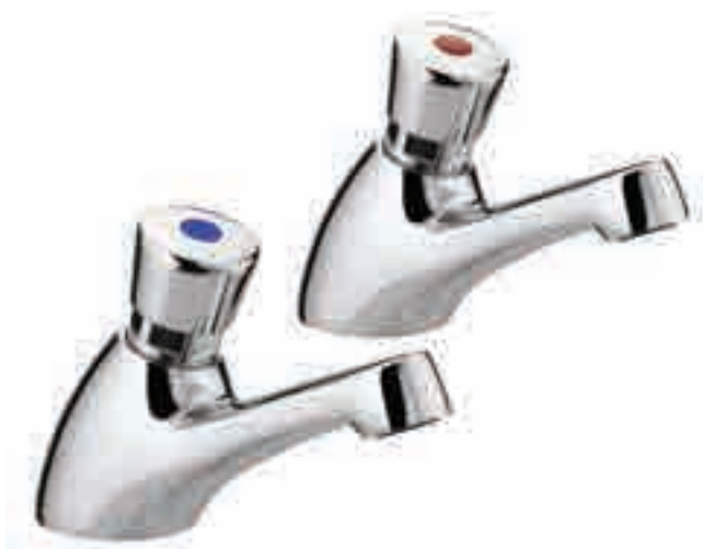
Non-concussive tap (pair)

complete with spray mixer & flow straightener water saving operation complete with flow restrictor to meet BREEAM