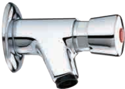
Non-concussive bib tap

back inlet non concussive bib tap water saving operation complete with flow restrictor to meet with BREEAM