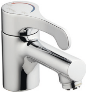
Lever action mixer

self draining spout adjustable temperature limit stop