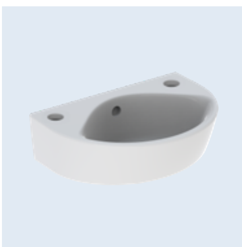
Alcona 360 x 250mm handrinse basin

co-ordinating alcona range smaller, compact design