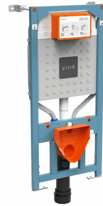
Product Code: 762-5805-01