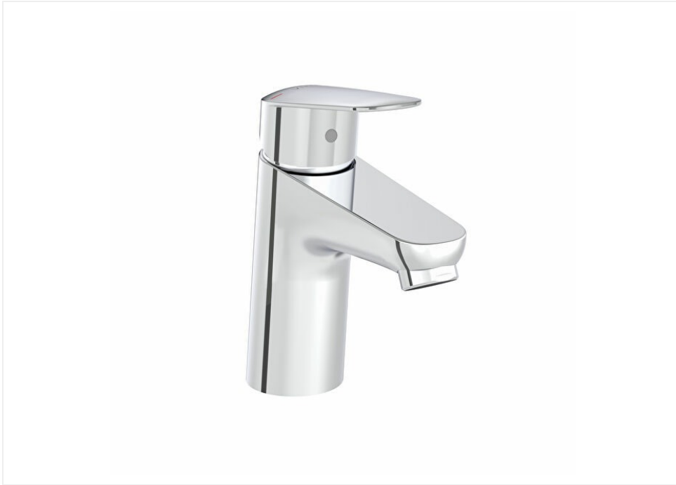
Collection: Flow Round