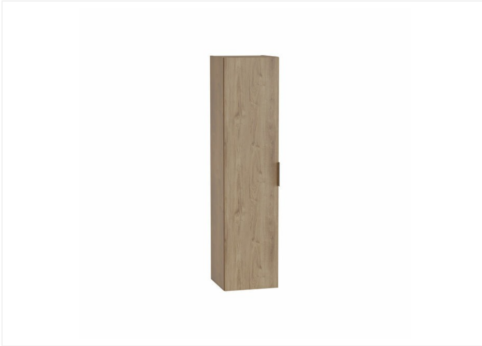
Collection: S20 Square