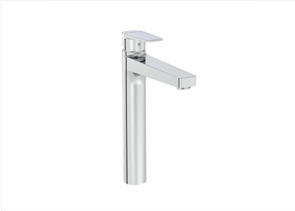
Collection: Flow Square