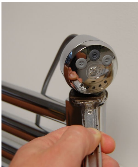
Align & seal using spanner