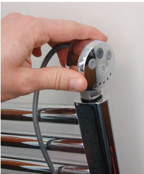
Screw in by hand