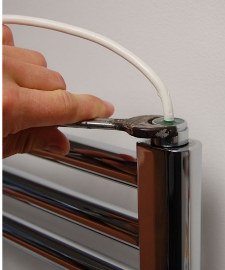
Nip to seal joint