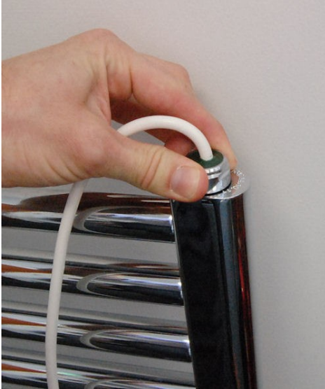
Screw in finger tight